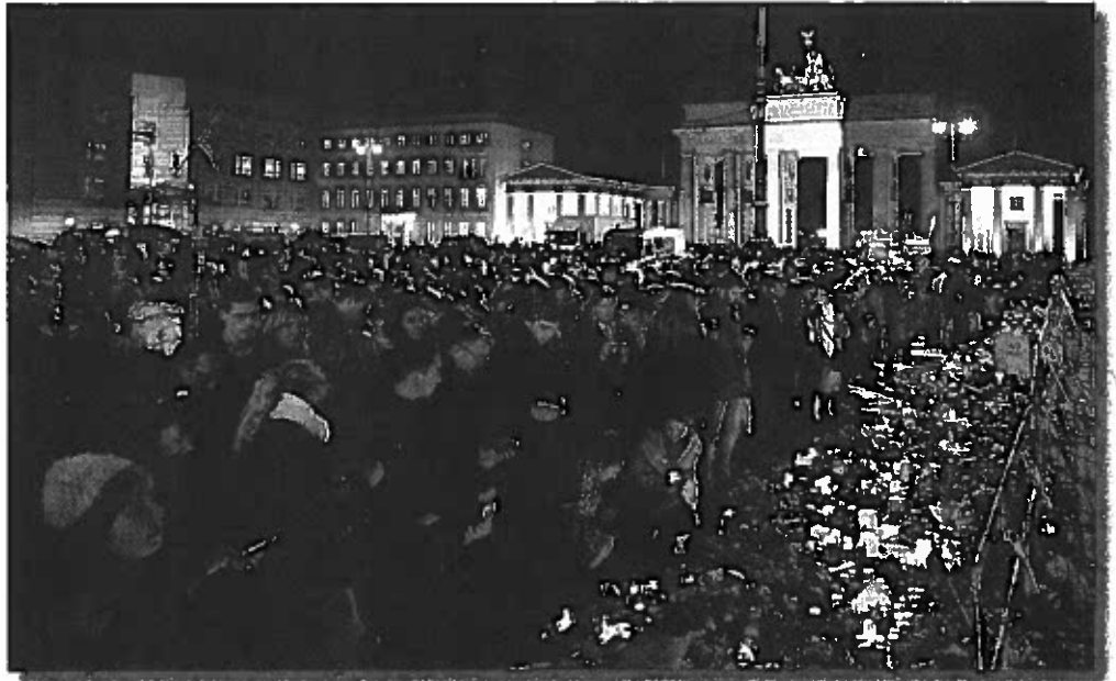
In a vigil in Germany, thousands mourned victims killed in the Nov. 13 attacks in Paris, France. In the background, Berlin's Brandenburg Gate is lit in the French national colors.

Good information was the antidote for irrational worries, she said. "I think I dissipated some of their fears."